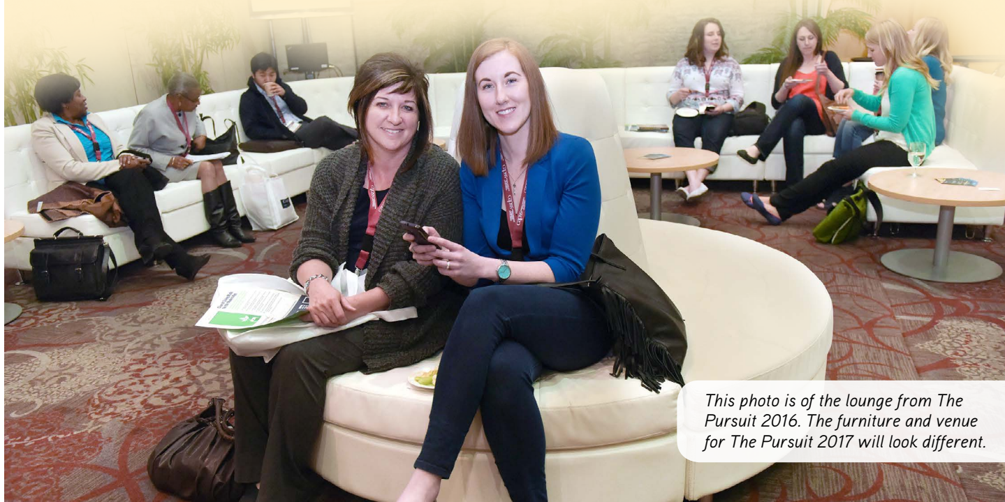
This photo is of the lounge from The Pursuit 2016. The furniture and venue for The Pursuit 2017 will look different.

Note: There will be a charging station in each lounge. If you would like to sponsor the charging station in your lounge, please see p. 7 for details.